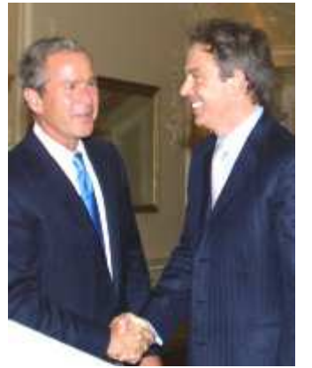
President Bush and Tony Blair smiling, but still no WMD's!

The invasion of Iraq was unnecessary and the case for war was fatally flawed, says Lib Dem leader Charles Kennedy.